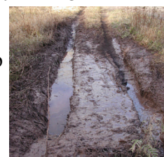
Recent truck damage near Amity Creek, Duluth