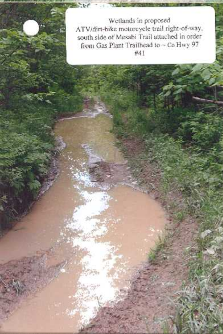
Wetlands in proposed ATV/dirt-bike motorcycle trail right-of-way, south side of Mesabi Trail attached in order from Gas Plant Trailhead to ~ Co Hwy 97 #41