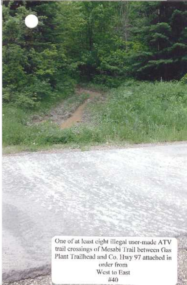
One of at least eight illegal user-made ATV trail crossings of Mesabi Trail between Gas Plant Trailhead and Co. Hwy 97 attached in order from West to East #40