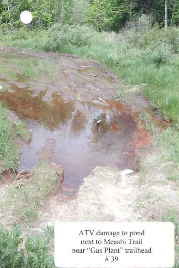
ATV damage to pond next to Mesabi Trail near "Gas Plant" trailhead # 39