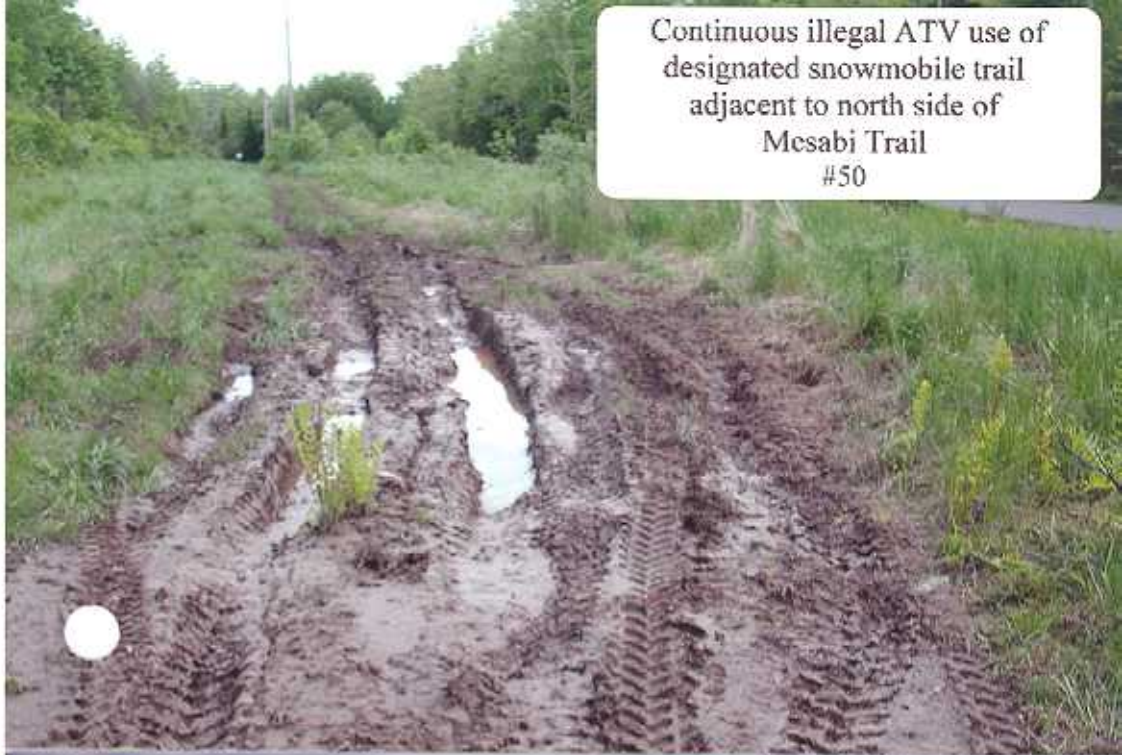
Continuous illegal ATV use of designated snowmobile trail adjacent to north side of Mesabi Trail #50