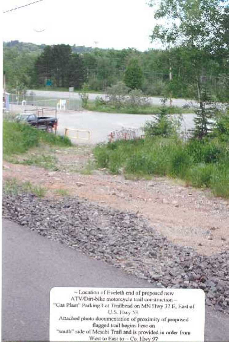
~ Location of Eveleth end of proposed new ATV/Dirt-bike motorcycle trail construction - "Gas Plant" Parking Lot Trailhead on MN Hwy 37 E, East of U.S. Hwy 51. Attached photo documentation of proximity of proposed flagged trail begins here on "south" side of Mesabi Trail and is provided in order from West to East to ~ Co. Hwy 97