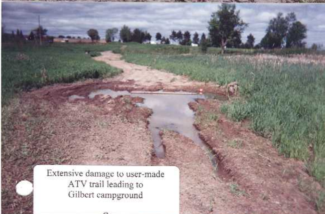
Extensive damage to user-made ATV trail leading to Gilbert campground